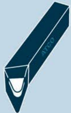
RH Side Tool Shown